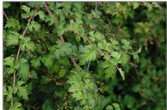
Cutleaf Stephanandra foliage