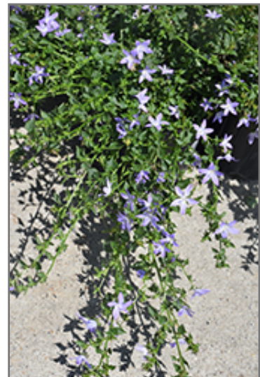
Blue Waterfall Serbian Bellflower in bloom