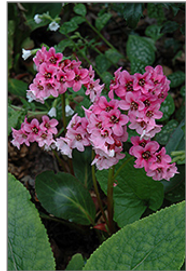
Pink Dragonfly Bergenia flowers