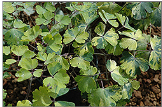
Leprechaun Gold Columbine foliage