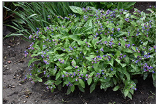
Dark Vader Lungwort in bloom