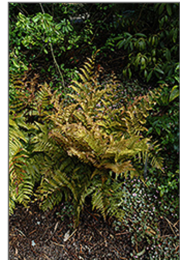
Autumn Fern