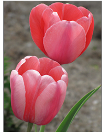
Pink Impression Tulip flowers