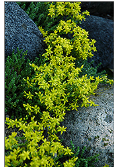
Six Row Stonecrop flowers