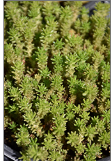
Six Row Stonecrop foliage

Six Row Stonecrop is a fine choice for the garden, but it is also a good selection for planting in outdoor pots and containers. Because of its spreading habit of growth, it is ideally suited for use as a 'spiller' in the 'spiller-thriller-filler' container combination; plant it near the edges where it can spill gracefully over the pot. Note that when growing plants in outdoor containers and baskets, they may require more frequent waterings than they would in the yard or garden.