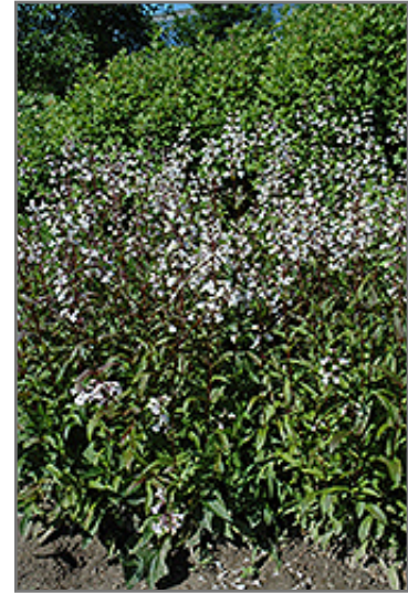
Husker Red Beard Tongue in bloom

Husker Red Beard Tongue is a fine choice for the garden, but it is also a good selection for planting in outdoor pots and containers. With its upright habit of growth, it is best suited for use as a 'thriller' in the 'spiller-thriller-filler' container combination; plant it near the center of the pot, surrounded by smaller plants and those that spill over the edges. Note that when growing plants in outdoor containers and baskets, they may require more frequent waterings than they would in the yard or garden.