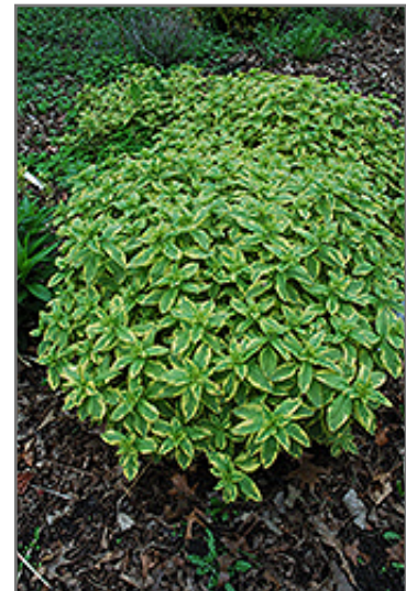
Golden Alexander Loosestrife