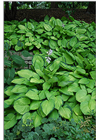
Gold Standard Hosta in bloom