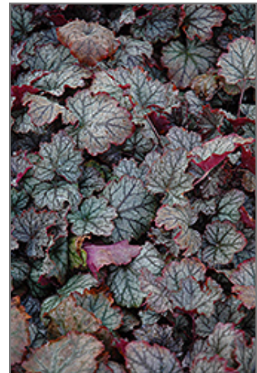
Raspberry Ice Coral Bells foliage