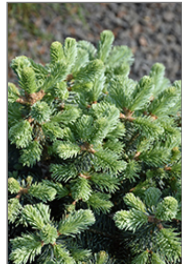
Dwarf Blue Rocky Mountain Fir foliage