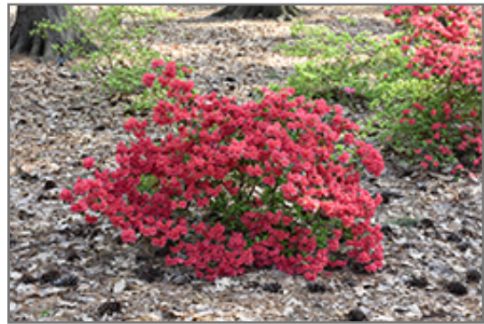
Girard's Crimson Azalea in bloom