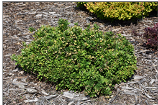
Moscato Barberry