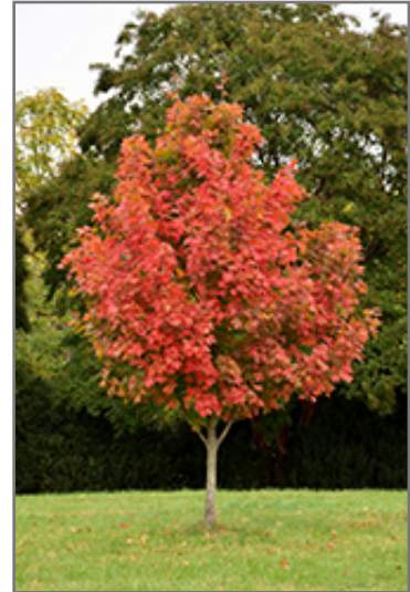
John Pair Sugar Maple in fall