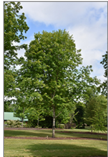
John Pair Sugar Maple