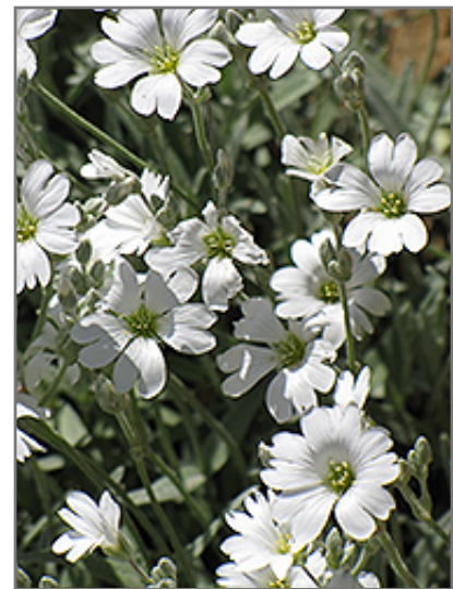
Snow-In-Summer flowers