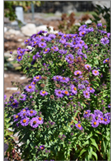
Purple Beauty Aster flowers

This plant does best in full sun to partial shade. It prefers to grow in average to moist conditions, and shouldn't be allowed to dry out. It is not particular as to soil type or pH. It is somewhat tolerant of urban pollution. This is a selection of a native North American species. It can be propagated by division; however, as a cultivated variety, be aware that it may be subject to certain restrictions or prohibitions on propagation.