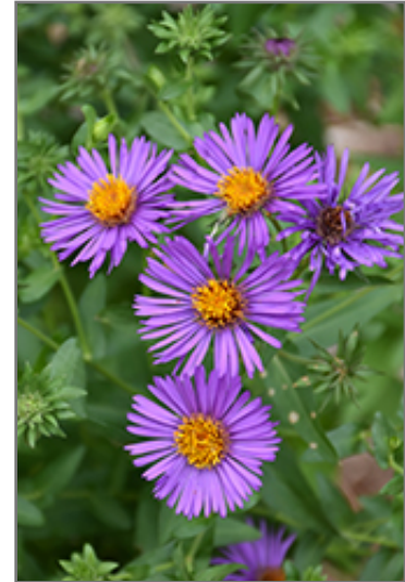
Purple Beauty Aster flowers