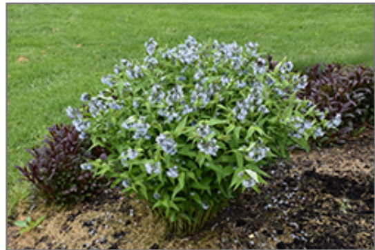
Blue Star Flower in bloom