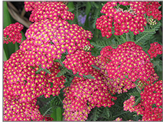
Galaxy Paprika Yarrow flowers

Galaxy Paprika Yarrow is recommended for the following landscape applications;