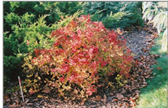
Golden Princess Spirea in fall