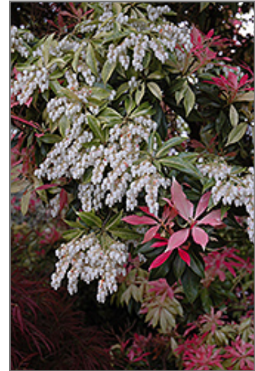
Valley Fire Japanese Pieris flowers

Valley Fire Japanese Pieris is recommended for the following landscape applications;