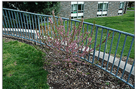
Dwarf Bush Cherry in bloom