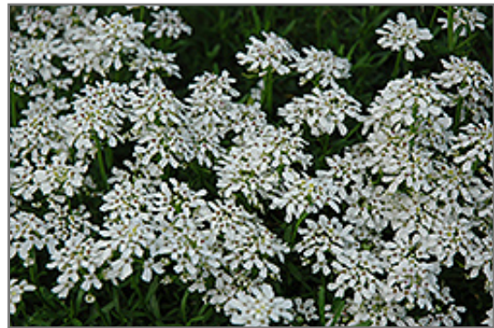
Little Gem Candytuft flowers