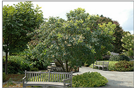
American Smoketree in bloom

American Smoketree is recommended for the following landscape applications;