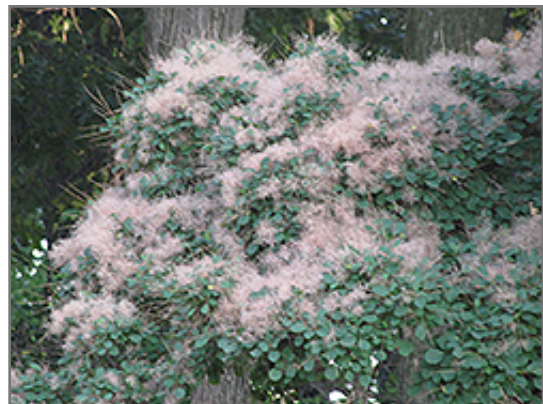
American Smoketree in bloom