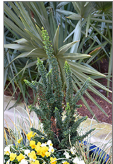
Chirimen Hinoki Falsecypress

Chirimen Hinoki Falsecypress makes a fine choice for the outdoor landscape, but it is also well-suited for use in outdoor pots and containers. With its upright habit of growth, it is best suited for use as a 'thriller' in the 'spiller-thriller-filler' container combination; plant it near the center of the pot, surrounded by smaller plants and those that spill over the edges. Note that when grown in a container, it may not perform exactly as indicated on the tag - this is to be expected. Also note that when growing plants in outdoor containers and baskets, they may require more frequent waterings than they would in the yard or garden.