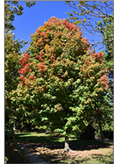
Endowment Sugar Maple