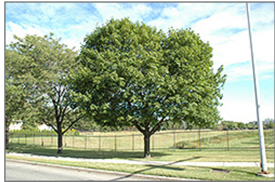
Norway Maple