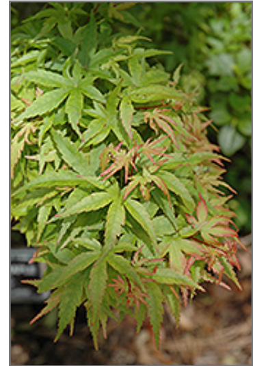
Sharp's Pygmy Japanese Maple foliage