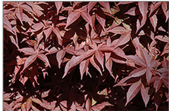
Rhode Island Red Japanese Maple foliage