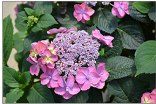
Tuff Stuff Hydrangea flowers

Tuff Stuff Hydrangea makes a fine choice for the outdoor landscape, but it is also well-suited for use in outdoor pots and containers. With its upright habit of growth, it is best suited for use as a 'thriller' in the 'spiller-thriller-filler' container combination; plant it near the center of the pot, surrounded by smaller plants and those that spill over the edges. It is even sizeable enough that it can be grown alone in a suitable container. Note that when grown in a container, it may not perform exactly as indicated on the tag - this is to be expected. Also note that when growing plants in outdoor containers and baskets, they may require more frequent waterings than they would in the yard or garden.