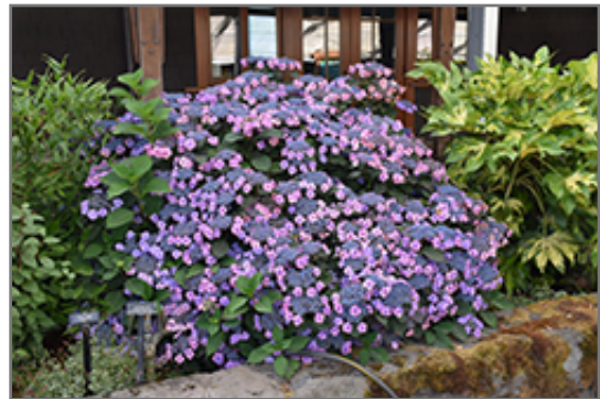
Tuff Stuff Hydrangea in bloom