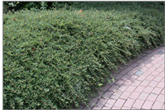
Coral Beauty Cotoneaster