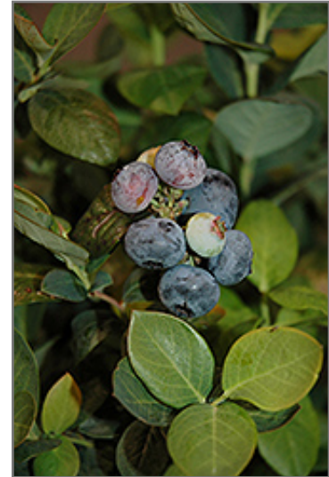
Peach Sorbet Blueberry fruit

Peach Sorbet Blueberry features dainty clusters of white bell-shaped flowers hanging below the branches in mid spring. It has green evergreen foliage. The glossy oval leaves turn an outstanding deep purple in the fall, which persists throughout the winter. It features an abundance of magnificent blue berries from early to mid summer.