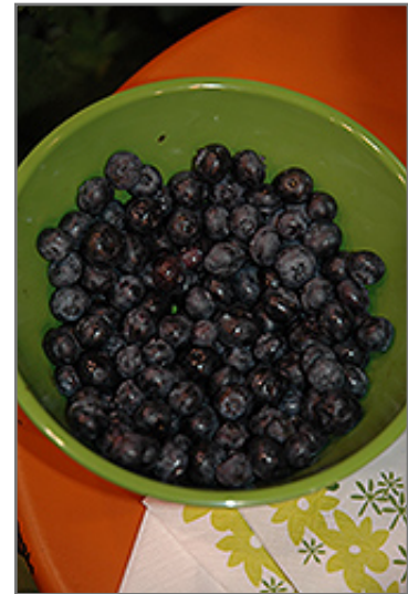
Peach Sorbet Blueberry fruit

This shrub is quite ornamental as well as edible, and is as much at home in a landscape or flower garden as it is in a designated edibles garden. It does best in full sun to partial shade. It does best in average to evenly moist conditions, but will not tolerate standing water. It is very fussy about its soil conditions and must have sandy, acidic soils to ensure success, and is subject to chlorosis (yellowing) of the foliage in alkaline soils. It is quite intolerant of urban pollution, therefore inner city or urban streetside plantings are best avoided, and will benefit from being planted in a relatively sheltered location. Consider applying a thick mulch around the root zone in winter to protect it in exposed locations or colder microclimates. This particular variety is an interspecific hybrid.