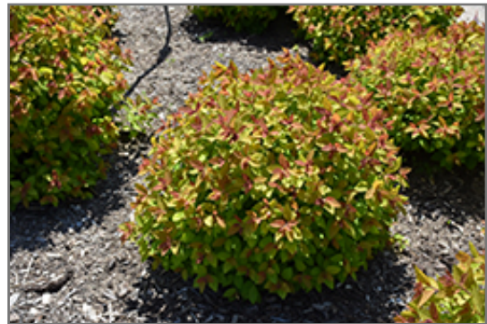
Double Play Big Bang Spirea