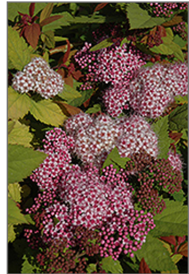
Double Play Big Bang Spirea flowers

Double Play Big Bang Spirea is recommended for the following landscape applications;