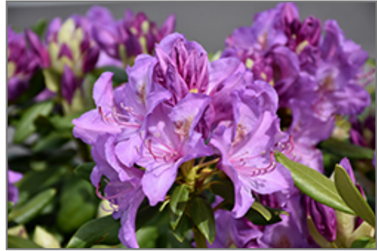
Boursault Rhododendron flowers