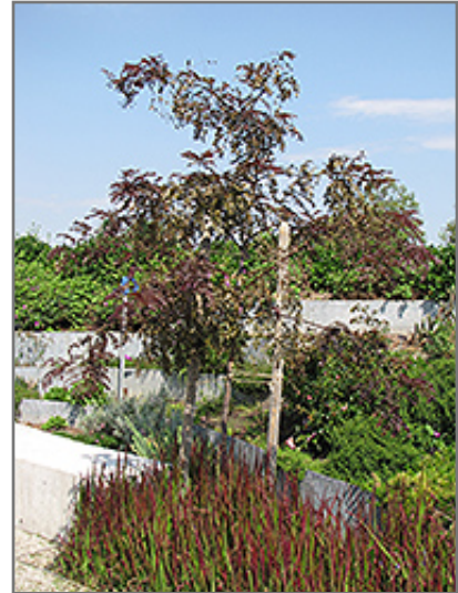
Ruby Lace Honeylocust

This tree should only be grown in full sunlight. It is very adaptable to both dry and moist locations, and should do just fine under average home landscape conditions. It is not particular as to soil type or pH, and is able to handle environmental salt. It is highly tolerant of urban pollution and will even thrive in inner city environments. This is a selection of a native North American species.