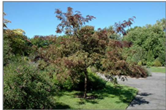
Ruby Lace Honeylocust