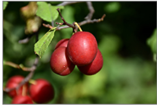
Toka Plum fruit