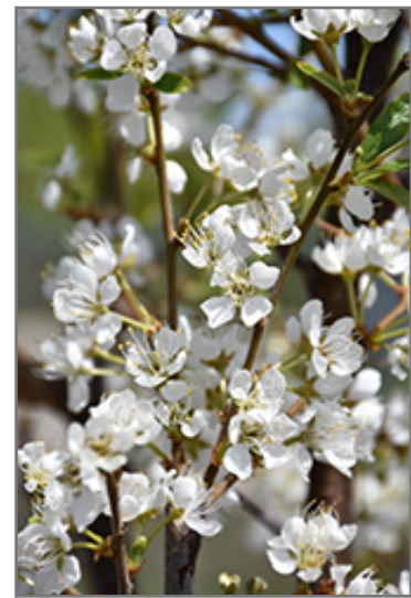
Toka Plum flowers