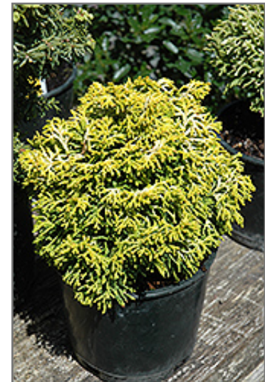
Butterball Hinoki Falsecypress