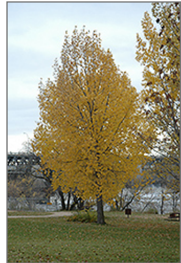
Siouxland Poplar in fall