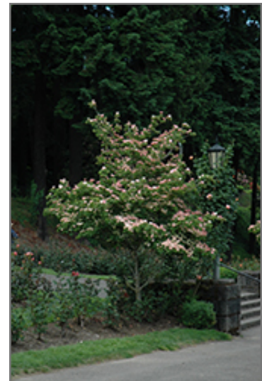
Heart Throb Chinese Dogwood in bloom