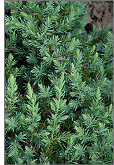
Blue Pacific Shore Juniper foliage

Blue Pacific Shore Juniper is recommended for the following landscape applications;