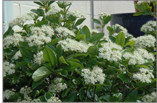
Winterthur Viburnum flowers

Winterthur Viburnum is a dense multi-stemmed deciduous shrub with an upright spreading habit of growth. Its average texture blends into the landscape, but can be balanced by one or two finer or coarser trees or shrubs for an effective composition.