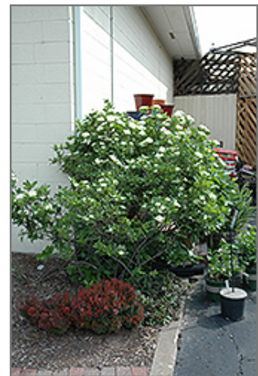
Winterthur Viburnum in bloom