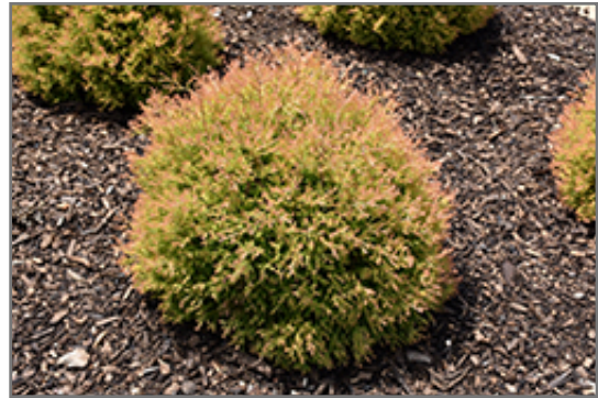
Fire Chief Arborvitae

Fire Chief Arborvitae is recommended for the following landscape applications;