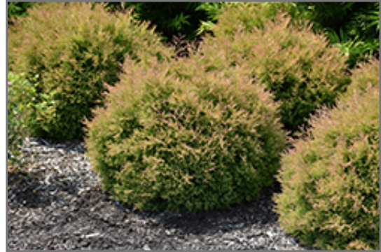
Fire Chief Arborvitae

Fire Chief Arborvitae will grow to be about 5 feet tall at maturity, with a spread of 5 feet. It tends to fill out right to the ground and therefore doesn't necessarily require facer plants in front, and is suitable for planting under power lines. It grows at a slow rate, and under ideal conditions can be expected to live for approximately 30 years.