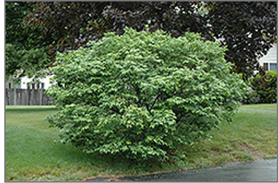
Compact Winged Burning Bush

Compact Winged Burning Bush will grow to be about 7 feet tall at maturity, with a spread of 7 feet. It tends to fill out right to the ground and therefore doesn't necessarily require facer plants in front, and is suitable for planting under power lines. It grows at a slow rate, and under ideal conditions can be expected to live for 50 years or more.