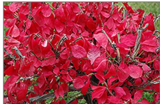
Compact Winged Burning Bush in fall