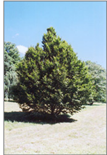
American Hornbeam

The American Hornbeam is recommended for the following landscape applications;