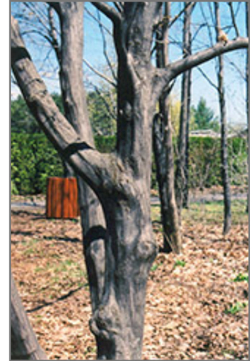
American Hornbeam bark

This tree performs well in both full sun and full shade. It is an amazingly adaptable plant, tolerating both dry conditions and even some standing water. It is not particular as to soil type or pH. It is somewhat tolerant of urban pollution. This species is native to parts of North America.