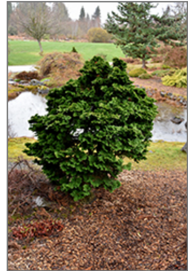
Dwarf Hinoki Falsecypress