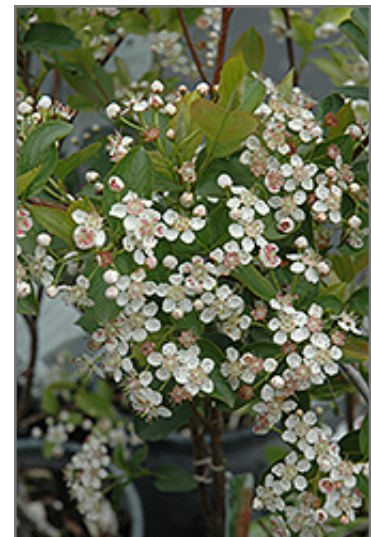
Viking Chokeberry flowers