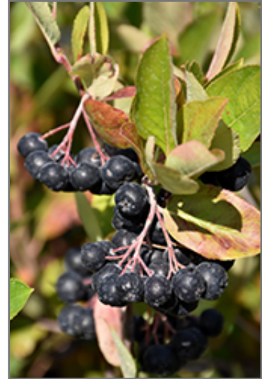
Viking Chokeberry fruit

This shrub should only be grown in full sunlight. It is an amazingly adaptable plant, tolerating both dry conditions and even some standing water. It is not particular as to soil type or pH, and is able to handle environmental salt. It is somewhat tolerant of urban pollution. This particular variety is an interspecific hybrid.