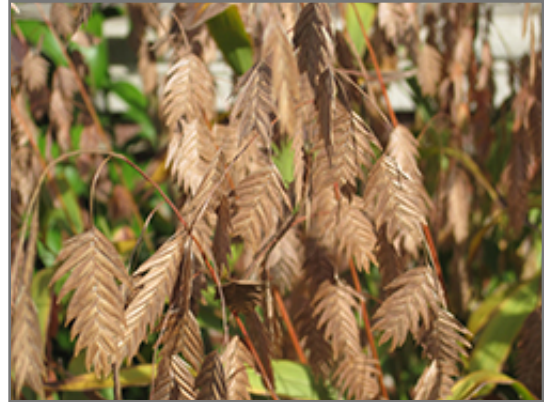
Northern Sea Oats fruit

Northern Sea Oats will grow to be about 4 feet tall at maturity, with a spread of 30 inches. Its foliage tends to remain dense right to the ground, not requiring facer plants in front. It grows at a medium rate, and under ideal conditions can be expected to live for approximately 10 years. As an herbaceous perennial, this plant will usually die back to the crown each winter, and will regrow from the base each spring. Be careful not to disturb the crown in late winter when it may not be readily seen!