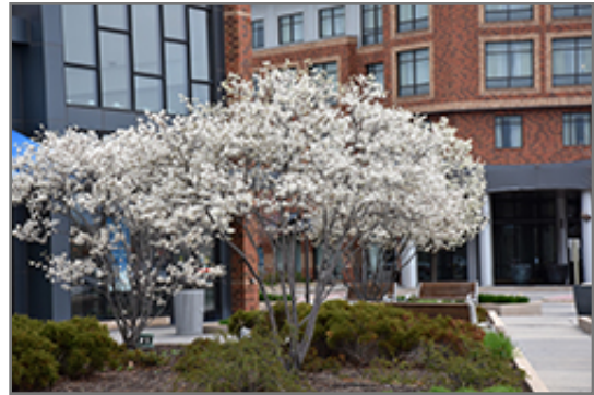
Autumn Brilliance Serviceberry in bloom

Autumn Brilliance Serviceberry is recommended for the following landscape applications;