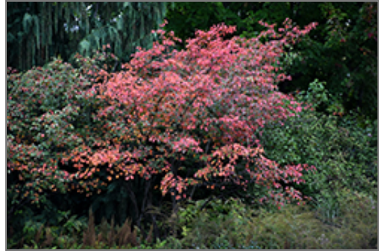
Autumn Brilliance Serviceberry in fall

This tree does best in full sun to partial shade. It prefers to grow in average to moist conditions, and shouldn't be allowed to dry out. It is not particular as to soil type or pH. It is somewhat tolerant of urban pollution. This particular variety is an interspecific hybrid.