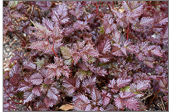
Delft Lace Astilbe foliage